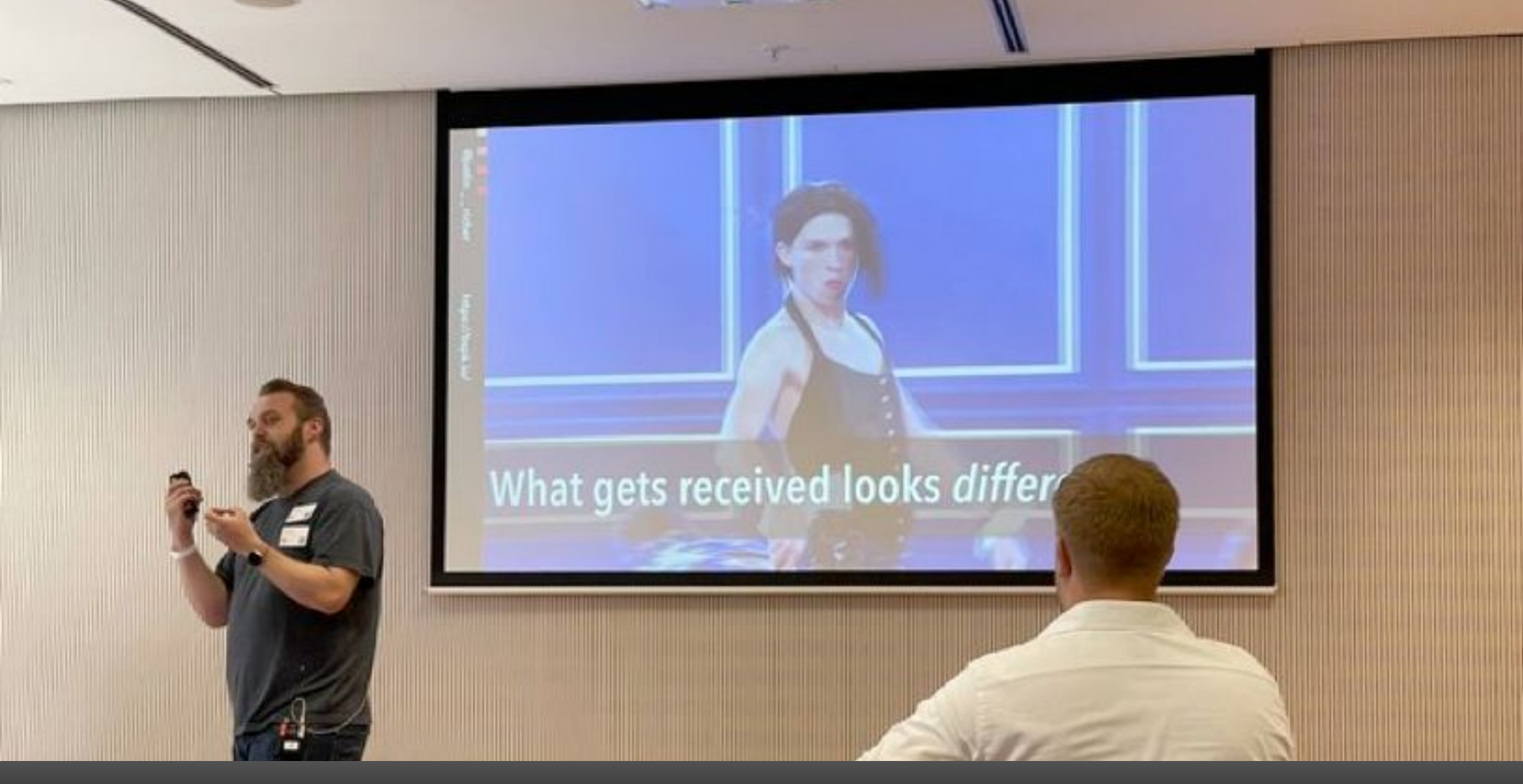
HTTP Signatures Roadshow!